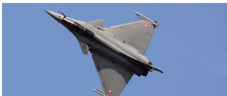
Aerospace & Defense