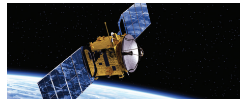
Space & Satellite Communications